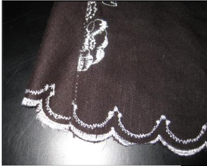
1. Right side hem.