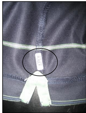
2. On inside seam.