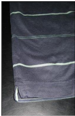
1. Right side of shirt.